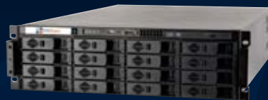
EditShare 3U Rack Unit Expandable to 12TB 27"(D) x 19"(W) x 5.25"(H)

* Depending on which configuration you purchase