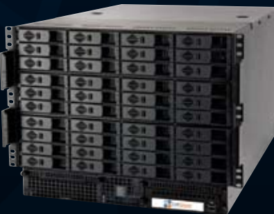
EditShare 8U Rack Unit Expandable to 30TB 27"(D) x 19"(W) x 14"(H)