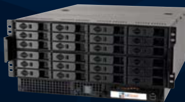
EditShare 5U Rack Unit Expandable to 18TB 25.4"(D) x 19"(W) x 8.75"(H)